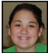
Jena Church July 10